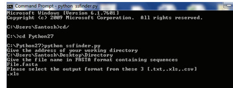
FIGURE 2: An overview of command prompt for using SSFinder in Windows operating system.

from the 7th column can be directly used as spacers in the gRNA designing.